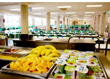
3 Dining Rooms and On-site Kitchen