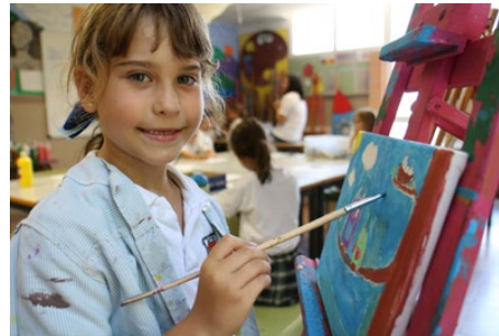
2 Art Classrooms