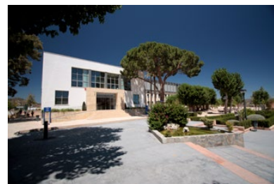
Variety of Outdoor Spaces