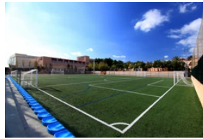
2 Football Pitches