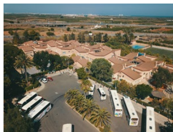
Bus Parking Area